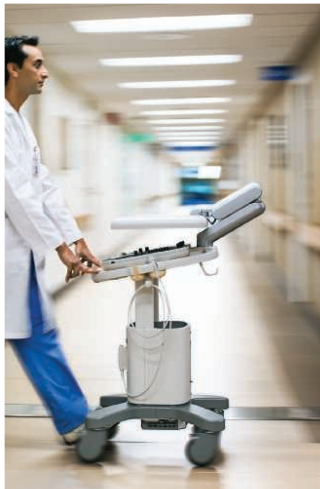
Lightweight and small in size, the ClearVue 650 is easy to maneuver and is a perfect fit in small spaces.

* Service agreement required for access to Philips Remote Services. Access to the internet required. Not all remote features available in all countries; contact your local Philips representative for details.