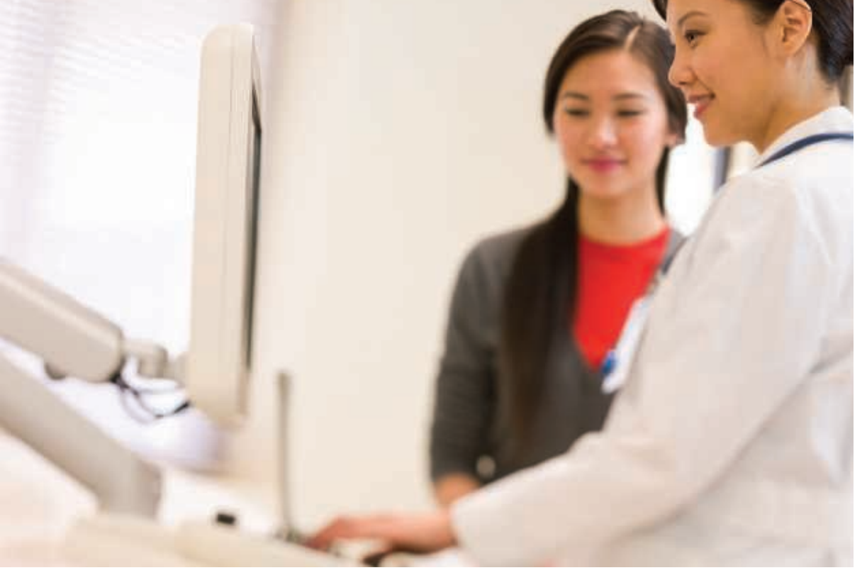
Advanced system automation streamlines your workflow and enhances exam consistency, so you can focus more on your patients.