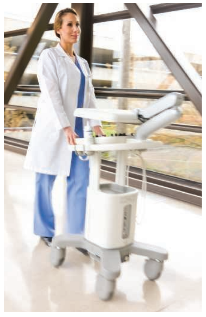
Lightweight and small in size, the ClearVue 550 is easy to maneuver and is a perfect fit in small spaces.

©2016 Koninklijke Philips N.V. All rights are reserved. Philips reserves the right to make changes in specifications and/or to discontinue any product at any time without notice or obligation and will not be liable for any consequences resulting from the use of this publication. Trademarks are the property of Koninklijke Philips N.V. or their respective owners.