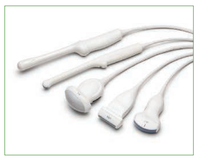
Designed for women's healthcare applications.